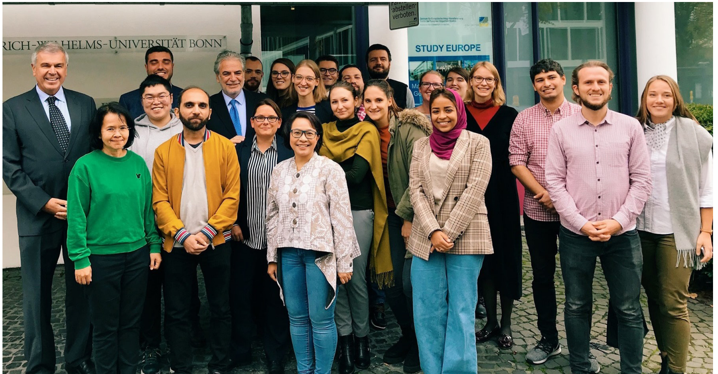
Former EU Commissioner Christos Stylianides has been appointed as Greece’s first minister for Climate Crisis and Civil Protection. In his visit to ZEI, the former EU Commissioner spoke to ZEI students (“Class of 2020”) and alumni about EU crisis management on the Union’s territory and in the world. On top of it, the former Commissioner put forward a ZEI Discussion Paper on European Emergency Coordination.

that the EU and the U.S. have given too much political weight to the Kosovo issue as compared to combating corruption and strengthening the rule of law. They should avoid treating the reform process and the resolution of the Kosovo issue as a zero sum game, in which one goal has to be sacrificed for the accomplishment of the other. Instead, stable and incremental progress can be made on both fronts.