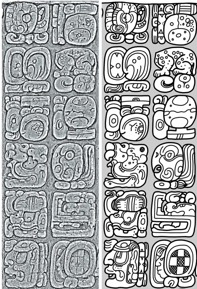
Figure 1. Palenque Tablet of the Sun (PAL TS), blocks C1-D6 – left: 3D mesh rendering with Lambertian radiance scaling, right: Drawing by Sven Gronemeyer, 2015

This term constitutes the collocation in C3 (Figure 1), which had not been completely identified in previous drawings of the inscription due to its ‘squeezed’ rendering by the sculptor. While the right half of C3 is clearly readable as T_4 NAH T_{60:528} hi, nah , “house, building”, the left half appeared less clear. As was faintly recognisable in the early photograph by Alfred Maudslay (Maudslay 1889-1902: pl. 87) (Figure 2a), but is clearly visible in the various renderings of the 3D scan (Figures 2b-e), the left part of block C3 consists of the sign T_{366} tz’a. An instance of the “doubler”, the diacritic marker for a doubled spelling of the respective sign’s phonetic value (Harris 1993:ix, Stuart & Houston 1994:46, Zender 1999:102ff.), is integrated into its upper part. All in all, C3 can now be identified as {}^2 tz’a-NAH-hi, tz’atz’+nah , which was previously unknown in the Maya epigraphic record and seems to be an architectural term, since it ends with the generic nah , “building, structure” (Stuart 1998:376) that refers to a man-made structure as a physical object. While there is a variety of names and generic architectural terms that designate actual buildings, one should not overlook the fact that such terms can also be applied metaphorically to other classes of objects in various contexts.