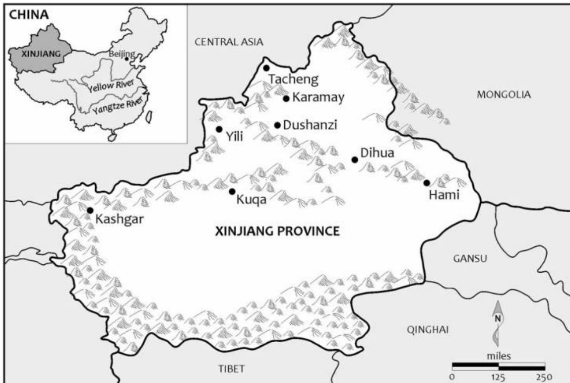
Map 1, Map of Xinjiang