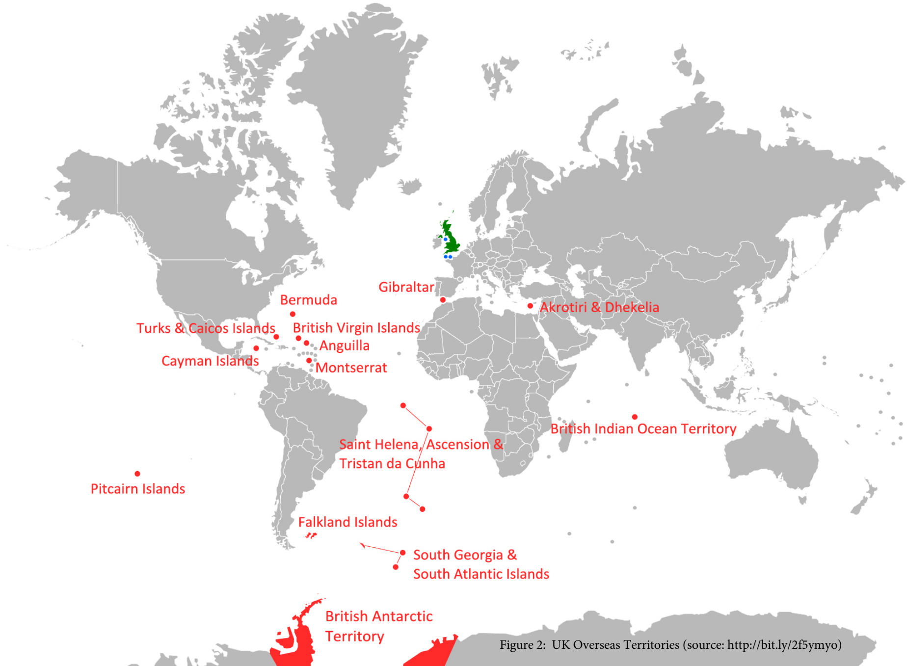
Figure 2: UK Overseas Territories