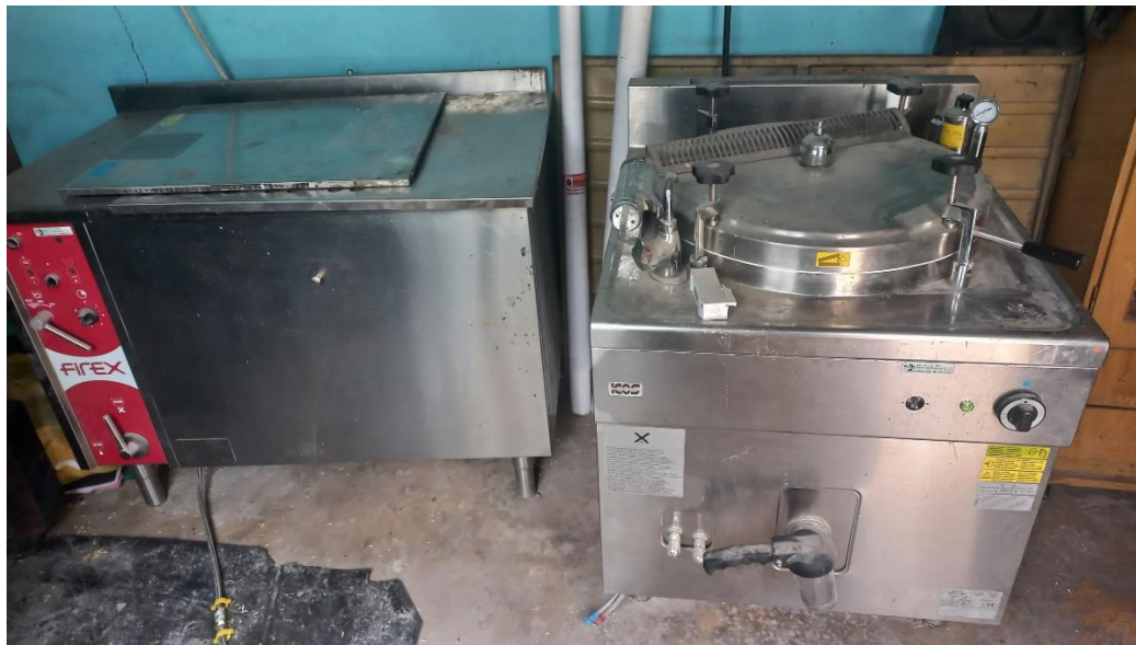
Figure 1: The mixer and washer machines used in process OFSP at Duwabe bakeries

Duwame Bakery specializes in selling bakery products made from orange-fleshed sweet potato (OFSP) puree. OFSP is an improved variety of sweet potato with high vitamin A content. The motivation behind starting the business was to provide healthy food with the addition of OFSP puree. The company received grant funding from BioInnovate Africa. The company used the funding to purchase pilot production equipment (Figure 3). The company also received a training from Growth Africa and Hawassa University. The main challenge faced by the company is the seasonal supply of OFSP. Other challenges include absence of a 3-phase transformer to supply electricity to the company's machine and difficulties in sourcing of OFSP due the ongoing political conflict in the country. The company is also constrained by limited operational space and has been unsuccessful in its applications for space allocation at the Hawassa Industrial Park.