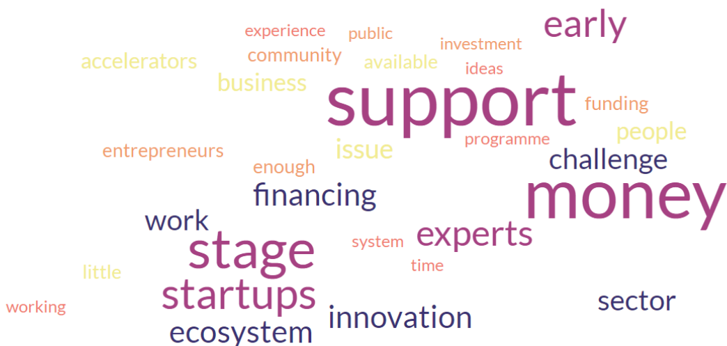
Figure 5: Word cloud on the importance of strengthen startup ecosystem in East Africa drawn from the FGD data

'The space we are occupying now was given to us by the local government that recognized the importance of our product. We pay a subsidized rent for this commercial space.' [Start-up in Ethiopia 3]