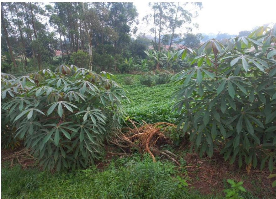
Figure 4: Cassava and sweet potato multiplication at Senai Farm Supplies Ltd, Kampala

Senai Farm Supplies focuses on vegetatively propagated crops like sweet potato, banana and cassava (Figure 6). They also sensitize farmers on the use of clean planting materials and facilitate market connections. The support and guidance they have received from Bioinnovate Africa includes infrastructure support, organizing farmer cluster groups, and training on branding, product development and market testing. Plans for scaling up or expanding the business are limited by space availability. Unpredictable markets weaken the linkage between production and the market. Therefore, the company offers discounts on planting materials to farmers who book in advance.