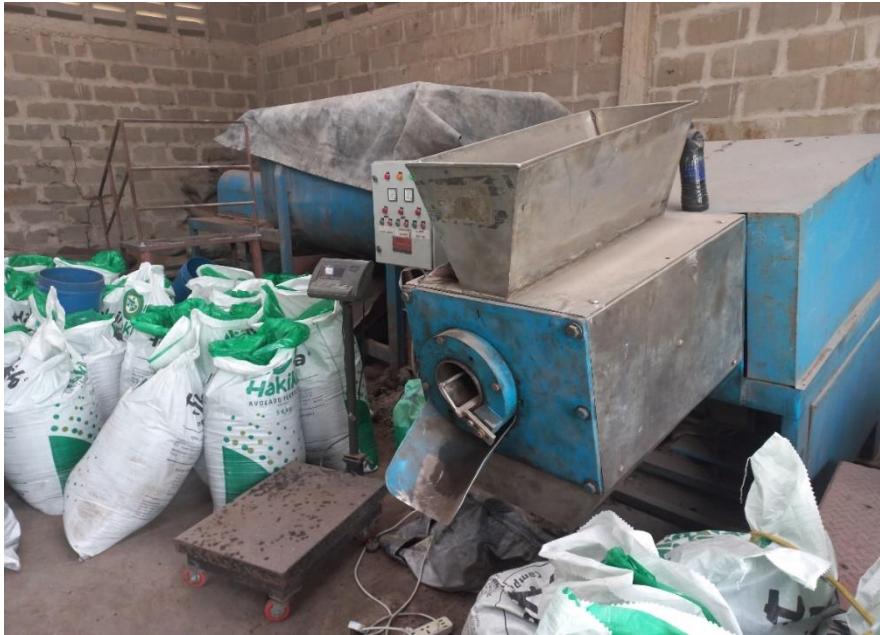
Figure 3: Mixer used for Hakika fertilizer production at Guavay company