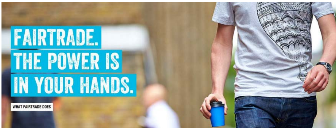
Fig. 1. Advert 1 (FAIRTRADE FOUNDATION 2015c).

FAIRTRADE FOUNDATION'S advert (see figure 2) is set in landscape format. The background is blurred. One might discern people on the left-hand side in front of a house or café. On the right-hand side there is a hint of grey and green, maybe a park or street lined with trees. To me, the scene suggests an urban setting with some greenery. In the foreground there is only one thing that is sharply focused: the torso of a white, male, presumably young person. He is dressed in current fashion, wearing blue jeans, a grey t-shirt with a black print and a wristwatch. His hands are prominent and central to the image. In his right hand, he carries a coffee to go in a plain blue cup and he is walking briskly. The front left of the advert is occupied by the slogan in white on a blue ground: " Fairtrade. The power is in your hands. "