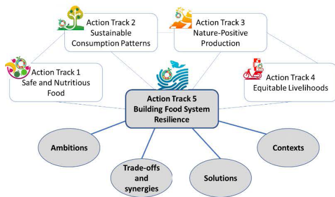
Figure 1. Representation of the integrative perspective of Action Track 5 across other action tracks and key elements addressed by Action Track 5 to build food system resilience.

The concept of resilience first emerged in the context of ecological stability theory (Holling 1973). It was directed at understanding the capacity of ecosystems to sustain perturbations